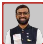
Sachin Bhandary Service Apartment