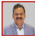
Lakshminarayana Vaddi Silk Sarees