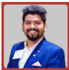
Sachin S Raikar Fine Jewelry