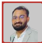
Vimal Jain Office Supplies